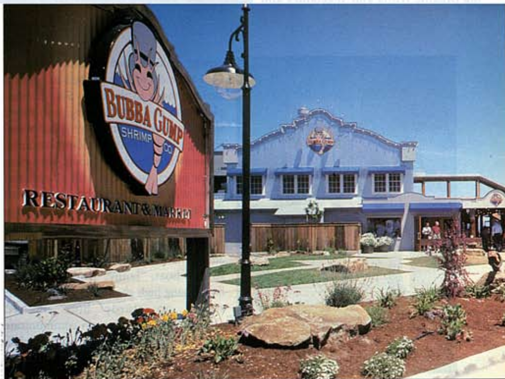
Bubba Gump Shrimp Co. Restaurant and Market